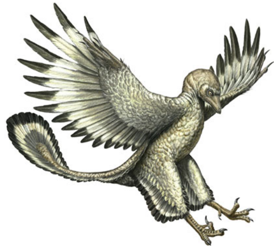
Fig. 4 Reconstruction of Archaeopteryx . Artwork by Davide Bona-donna. Archaeopteryx lithographica -specimens typically represent animals roughly the size of a magpie, although some were larger, about the size of a raven (see Erickson et al. 2009)