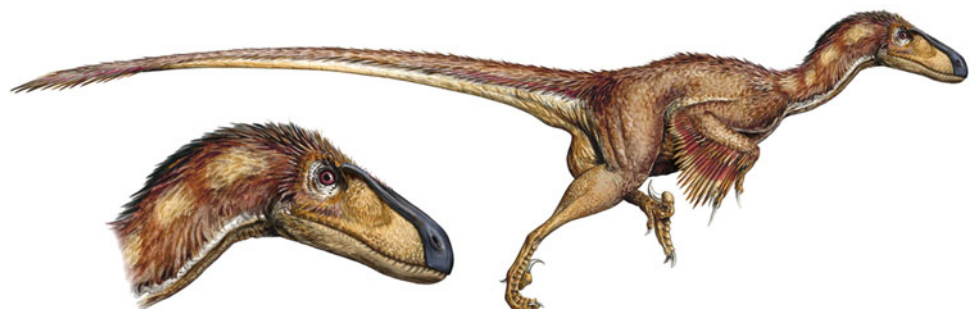
Fig. 6 Reconstruction of a feathered Deinonychus antirrhopus . The morphology and distribution of the plumage is based on recent paleontological discoveries from Asia. Artwork by Davide Bonadonna. Total body length of Deinonychus : ca. 3.3 m

In terms of skeletal evidence, it is now well established that theropod dinosaurs share with birds a large number of key features (Fig. 8), including but not limited to: a bipedal posture, extensive pneumatization of the skeleton (O’Connor and Claessens 2005; Sereno et al. 2008), the presence of a furcula, swivel-like wrist joints (semi lunate