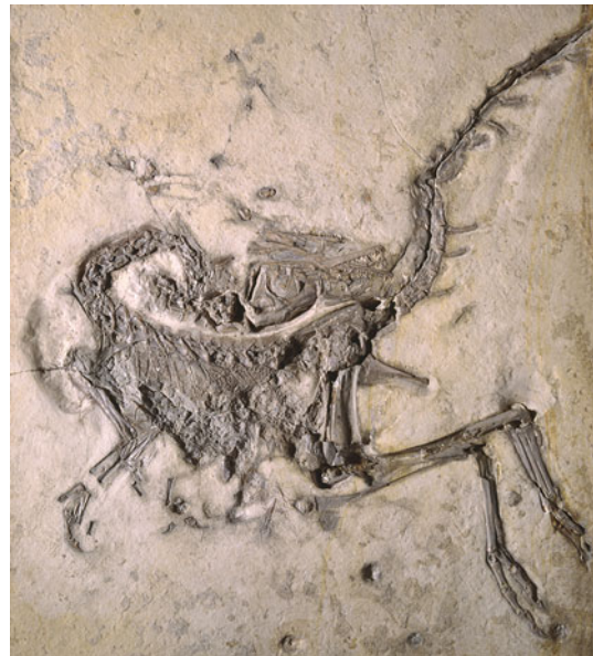
Fig. 5 Photograph of the Munich specimen of the small predatory dinosaur Compsognathus longipes Wagner (1861), which was interpreted as a bird-like reptile. The total body length of large Compsognathus exceeded 1 m (the Munich specimen is considerably shorter and represents a juvenile; see Therrien and Henderson 2007)

such as a thecodont origin as more likely (Heilmann 1926). These views became widespread following the publication of Heilmann’s influential book The Origin of Birds , aided to no small extent by the incredibly vibrant life illustrations Heilmann included in this work. By the early twentieth century, dinosaurs were no longer thought to be particularly relevant to bird origins, despite the existence of a truly astonishing fossil from Europe.