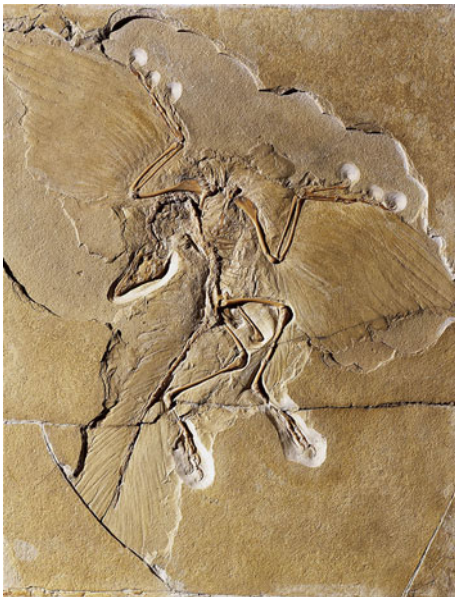
Fig. 3 Photograph of the Berlin Archaeopteryx lithographica (or siemensii ; see Mayr et al. 2007).

While Huxley had little doubt about the dinosaurian origin of birds, some authors considered other scenarios,