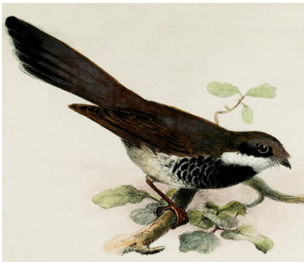
Fig. 1 Drawing of the “Ternate-bird” ( Rhipidura torrida ), discovered and described by Alfred R. Wallace on the summit of the volcano, 4,000 feet above the sea, on Ternate island (adapted from Wallace 1865)

In his popular book The World of Life , Wallace discussed several species of dinosaurs, and devoted one section to “The Earliest Birds” (Wallace 1910). He depicted and discussed the then famous “ Archaeopteryx macrura ”, figured the skull of A. siemensii (Fig. 2), and noted that “The very earliest known fossil bird is from the Upper Jurassic of Bavaria, and is beautifully preserved in the fine-grained beds of lithographic stone ... it is a true bird, notwithstanding its curiously elongated tail feathered on each side”. In the legend to his figure, he described this